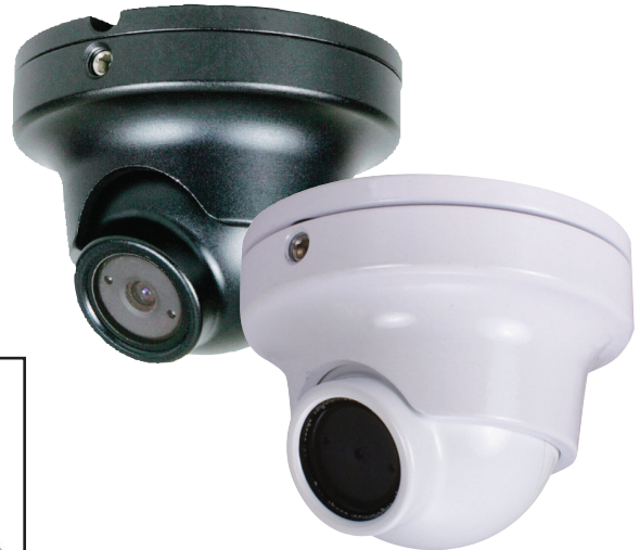
Shown at actual size